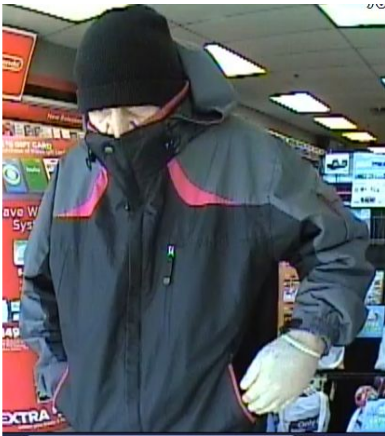
ATTEMPT TO IDENTIFY

Bear – Delaware State Police detectives are continuing their investigation into an armed robbery involving a knife, that occurred at approximately 10:09 a.m., Monday, March 26, 2018, at the GameStop, located at 1015 Governors Place, Bear, in which a white male suspect approached the 29 year old female employee at the sales counter, displayed a knife, and demanded money from the register.