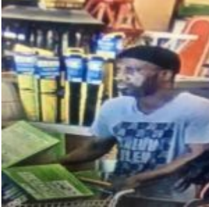
Home Depot Naamans Road