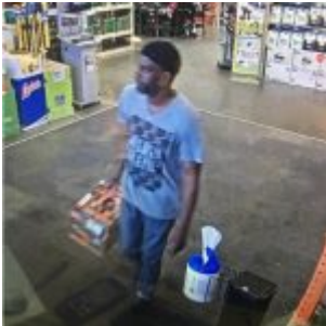
Home Depot Miller Road

Claymont – The Delaware State Police are investigating an armed robbery that took place at the Claymont Home Depot Saturday morning, and are asking for the public's assistance in identifying the suspect.