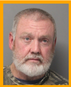
LAMB DEN , GRANVILLE

Download full-size mugshot Submit a tip about this offender View printable version of this data