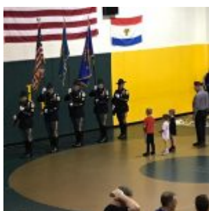
DSP Honor Guard