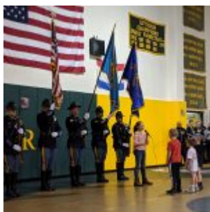
DSP Honor Guard